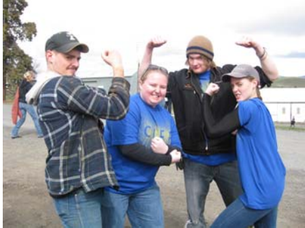
CFFA Ag. Olympics Team