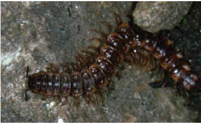
Figure 6. Some millipedes have flattened rather than rounded bodies.