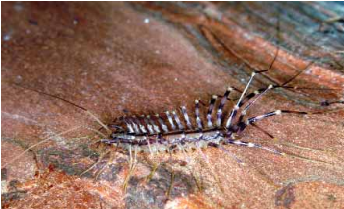
Figure 4. The house centipede is about 2.5 inches long and has 15 pairs of long, thin legs; its grey-tan body is marked with darker stripes that run down the back.

Scutigera coleoptrata , the house centipede (figure 4). This fast-running predator sometimes falls into empty sinks and bathtubs, where the slippery surfaces prevent it from escaping. Contrary to what some people say, house centipedes do not crawl up through drains from inside household plumbing. Avoid the possibility of bites by squashing them and rinsing down the drain, or removing specimens with a vacuum cleaner. Toss the vacuum cleaner bag in the trash after vacuuming, or empty the container into a bag, close tightly, and dispose of outside.