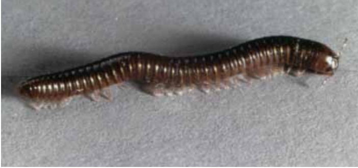
Figure 5. Commonly encountered millipedes in Idaho have cylindrical, multi-segmented bodies with dozens of short, hair-like legs directly under the body trunk.