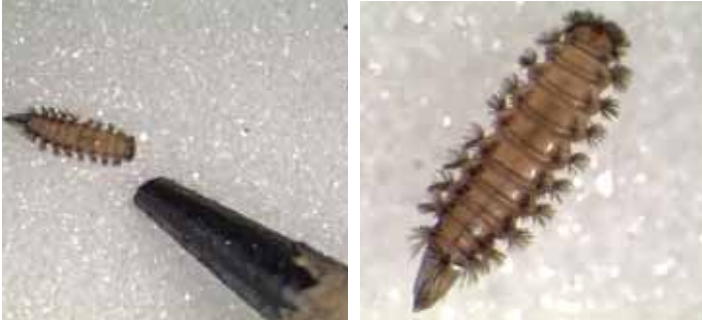
Figure 8. The bristly millipede at pencil point (left) is a tiny fuzzy species that sometimes appears in large numbers inside homes. Magnified view (right) shows fine needle-like hairs arranged in bunches, and two thicker brushes at the tip of the body.

Single individuals also sometimes are seen in the middle of winter inside homes. These inevitably were carried into the home on firewood stacked outside.