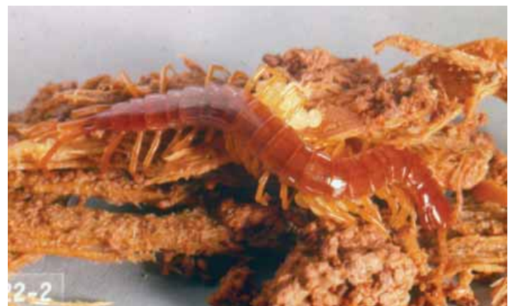
Figure 2. Centipedes have long, flattened bodies divided into segments, each bearing one pair of long, jointed running legs held out to the side of the body.

Seasonal life cycles of centipedes are little studied in Idaho. Depending on the species, females lay eggs in batches or singly in the soil. Hatchlings develop through seven or more molts before maturing. Immature life stages in some species look like small versions of adult centipedes. In other species, hatchlings only have four pairs of legs; these species grow additional legs and