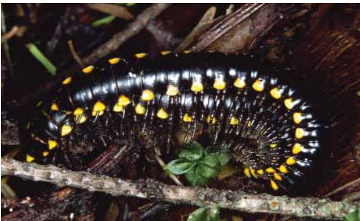
Figure 7. Millipedes marked in vivid warning colors (such as this mating pair of yellow-spotted millipedes that live in the forests of northern Idaho) secrete droplets of toxic chemicals that can produce a small discolored spot on bare skin.

defensive chemicals that perhaps could raise a small dark blister on tender skin, but these species seldom are encountered around the home. Outside the home, millipedes sometimes feed on tender shoots and roots of living seedling plants, but they generally should be considered beneficial recyclers in the garden. Inside the home they almost always are limited to lone accidental invaders. They also occur in rooms where there are lots of potted houseplants.