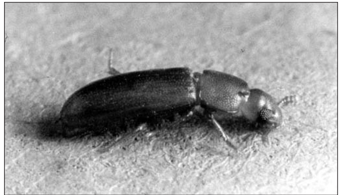
Fig. 2. Red flour beetle, adult