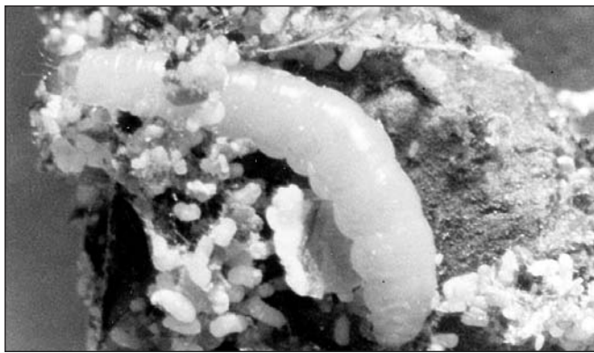
Fig. 3. Indian meal moth, larva and damage

Keep food storage areas free of spilled food, grain, or flour. Wheat grinding equipment must be kept clean when not in use. Wipe excess flour from grinder and vacuum immediately after use. Old dry food products and pet foods should be discarded if there is no longer a use for them. Periodic inspection and cleaning of areas behind shelves and appliances will help prevent food particle accumulation. Animal products, such as hides and feathers, require occasional dusting and treatment with appropriate insecticides to maintain good condition.